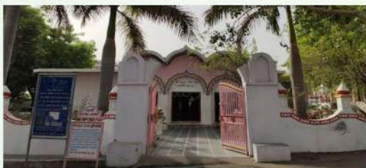
Luv Kush Ashram