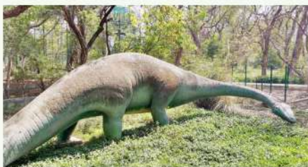
Allen Forest Zoo