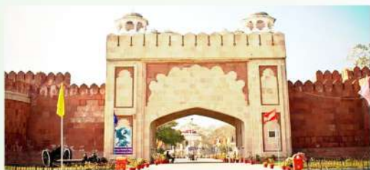
Nana Rao Smarak Park

The other attractions are - Allen Forest Zoo that ranks among the best zoos of the country and many other places like Phool Bagh, Nana Rao Park, Gautam Buddha Park, Moti Jheel, Green Park Bithoor etc., which make the visit to the City worthwhile. The members visiting the city may take out time to visit the above destinations.